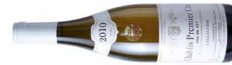
Jean Durup Père & Fils, Vaudevey 16.67

Rich, powerful aromas of minerals. A very crisp and super minerally palate with plenty of fruitiness. Open knit and quite full, freshened by good acidity which gives it a clean, long finish. Drink: 2012–2022. Alc: 13%