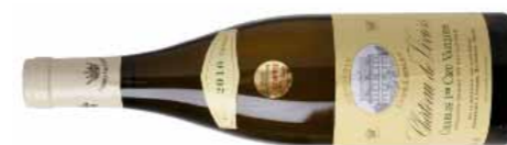
Lupé Cholet, Château de Viviers, Vaillons 16.69

Citrus and apricot nose. Rich palate with broad flavours which are almost the weight and complexity of grand cru. Attractive and zesty with a delicate attack. Lean and precise with good acidity. Will be a very good wine. Drink: 2012–2017. Alc: 13%