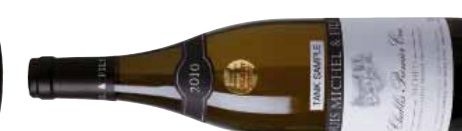
Louis Michel & Fils, Sechets (tank sample) 16.75

Delicate, precise nose of citrus, smoke and floral white fruit. Richer and weightier on the palate with lifted yet broad fruit, lovely minerality and good extract. A serious Chablis. Textured, stylish and long. Drink: 2012–2017. Alc: 13%