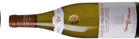
Domaine des Malandes, Côte de Léchet 16.63

Lovely creamy apricot, citrus and honey bouquet. Lavish fruit – more Chassagne than Chablis – with good acidity to balance the weight of fruit. It has a touch of chalky minerality on the finish. Seems oaky. Drink: 2012–2016. Alc: 13%