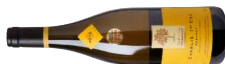
Isabelle & Denis Pommier, Beauroy 16.88

Gentle honeysuckle notes with white and yellow fruit and an apple nose. A taut, racy style with intensity and vigour and delicious fruit. Very good purity, clarity, finesse, balance and length. Drink: 2012–2017. Alc: 12.5%