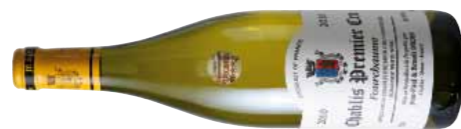
Domaine Jean-Paul & Benoît Droin, Fourchaume 16.83

Lovely salty, minerally aroma on the nose. It has ripe fruit, brisk acidity and some textured fruit on the palate which develops in the glass. Quite rich and full bodied with good energy. Vivid premier cru. Drink: 2012–2017. Alc: 13%