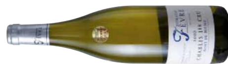
Domaine Nathalie & Gilles Fevre, Mont de Milieu 16.92

Leesy, honeyed character on the nose. A clear, solid premier cru, showing finesse, subtlety and length across the palate and on the finish. Very good, classic example. Lots to come. Drink: 2014–2020. Alc: 13%