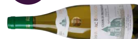
Jean-Marc Brocard, Vaillons 16.75