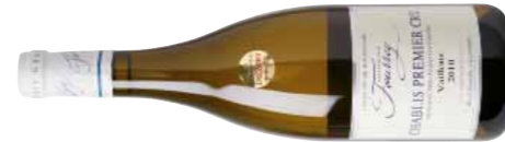
Domaine Fourrey, Vaillons 16.75

Honey, floral notes and apple on the nose. Quite rich and juicy – a broad style with a nice texture, good concentration and minerality on the finish. Still a little shut in now but will be good in time. Impressive. Drink: 2013–2017. Alc: 13%