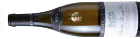
Louis Michel & Fils, Les Fôrets 16.67

Delicate nose of ripe fruit. It has good grip and is ripe and supple (in the Chablis context) with modest scope and length for a premier cru. Quite lightweight but nicely balanced. Drink: 2013–2020. Alc: 12.5%