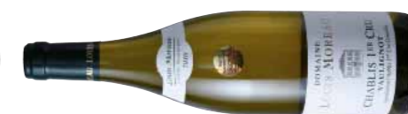
Domaine Louis Moreau, Vaulignot 16.67

Rich, ripe aromas of banana, honey, white fruit and mango. The palate shows elegance, clarity, depth and complexity – it is sweet and generous with atypical ripe characters but manages its weight very well. Drink: 2013–2017. Alc: 12.5%