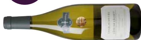
La Chablisienne, Côte de Léchet 16.94

£13–£18.90 Astrum Wine Cellars, Whitebridge Wines