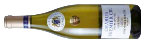
Simonnet-Febvre, Fourchaume 16.83

Bright citrus and smoke on the nose. A silky textured palate with good weight and minerality and spice on the finish. Quite unusual but has lovely depth of fruit, complexity, excellent length and balance. Drink: 2012–2018. Alc: 13%