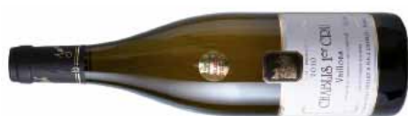
Domain Jean Collet & Fils, Vaillons 16.88

Attractive florality and good sappy fruit with saline and oyster shell aromas. Textured, intense and stony with good acidity. Not very expressive now but will be serious and rewarding with time. Classic. Drink: 2012–2015. Alc: 13%