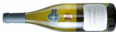
La Chablisienne, Montmains 16.83

Oak, honey, yellow fruit and apple compote on the nose. Reined in and compact style with taut, minerally, steely and citrusy fruit. It has lots of grip, depth and well integrated oak. Almost of grand cru quality. Drink: 2013–2018. Alc: 13%