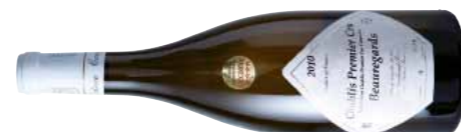
Caves Gendraud-Patrice, Beauregards 16.83

New oak, citrus and peach bouquet. It has a Chablis bite of tight acidity, an almost spritz attack and a fresh, vibrant finish. More oak on the palate is noticeable but it is quite elegant and still youthful. Drink: 2014–2020. Alc: 12.5%