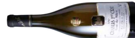
Domain Jean Collet & Fils, Mont de Millieu 16.67

Flowers, honey, smoke, toast and tropical fruit bouquet. Broad, creamy and sumptuous with generous tangy fruit, yet it still manages to be lean and shows lots of minerality. An impressive, elegant wine. Drink: 2013–2017. Alc: 13%