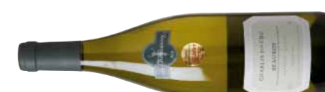
La Chablisienne, Beauroy 16.75

Good intensity of firm, flinty, oaky and honeyed hints on the nose. Rich, fresh and leesy with nice vital acidity, balance and power. It has a textured palate with layers of flavour showing both depth and youth. Drink: 2014–2020. Alc: 12.5%