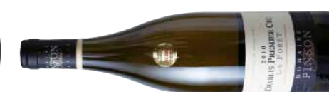
Domaine Pinson, Les Fôrets 16.67

Firm, closed nose showing a touch of oak. Quite backward yet substantial palate with easy, juicy, freshly ripe fruit, moderate complexity and a little oak. This needs time to develop, as the fruit is quite shy now. Drink: 2012–2019. Alc: 12.5%