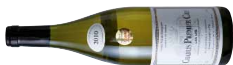
Daniel Dampt, Les Lys 16.83

Pure nose of butter, lemon, minerals and oyster shell. Creamy, smooth classically proportioned wine with a deep mineral core. Bright acidity adds freshness. Ripe and wholly savoury style. Very good. Drink: 2012–2018. Alc: 12.5%