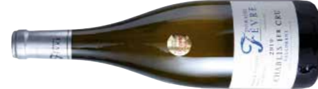
Domaine Nathalie & Gilles Fèvre, Vaulorent 16.83

Firm, tight nose. Quite nervy acidity with nice weight and bite, this is rich, lively and vital. A fine Chablis with ripe fruit and minerality across the palate and on the finish. Really fine and very attractive. Drink: 2014–2022. Alc: 13%